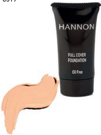
No 1 8519