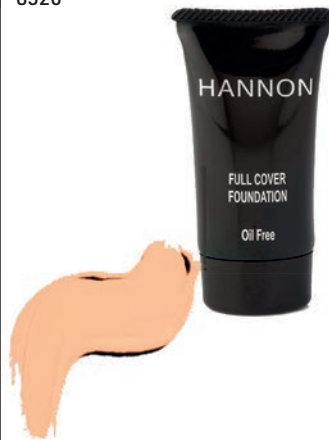
No 2 8520