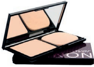
No 1 8512