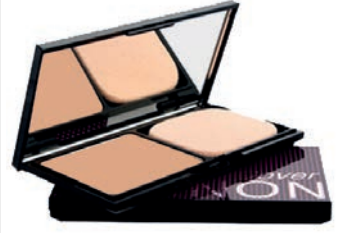
No 4 8515