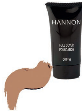
No 9 8525