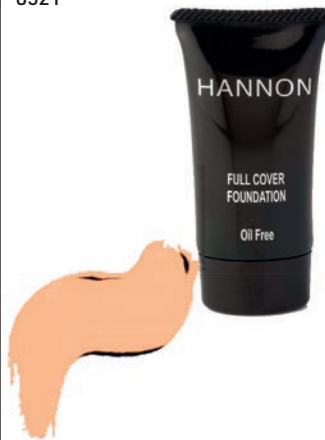
No 3 8521