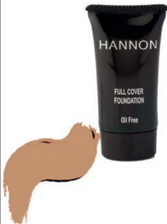
No 8 8524