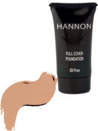
No 6 8523