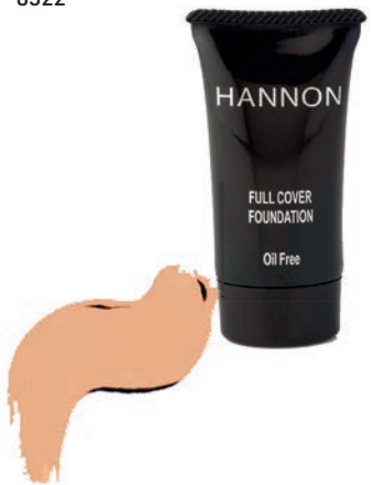
No 4 8522